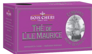
Corsaires Earl Grey