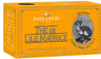
The Dodo Coconut