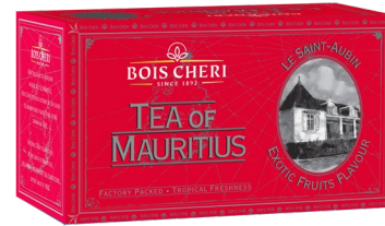
Le Saint Aubin Exotic