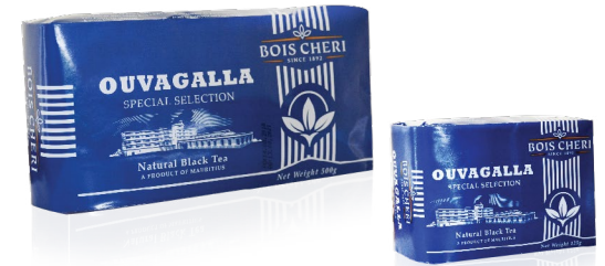
Ouvagalla – Black Tea