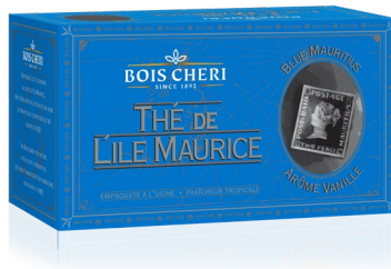
Blue Mauritius Vanilla