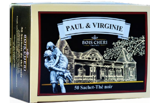
Paul et Virginie – Black Tea