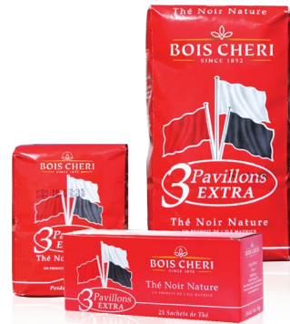
3 Pavillons – Black Tea

Loose Tea 500g / 250g / 125g 25 tea bags