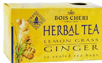
Lemon Grass Ginger