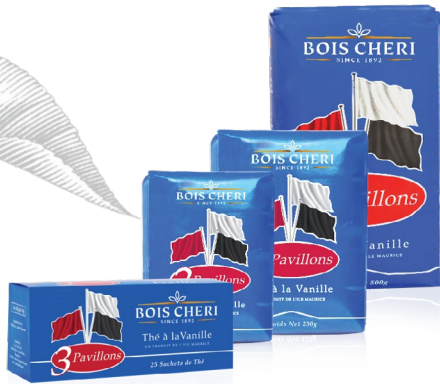
3 Pavillons – Vanilla

Experience the rich heritage and unparalleled quality that define our classic teas, each crafted to deliver a memorable and satisfying cup.