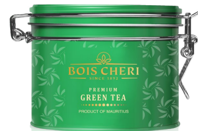
Green Tea Thé en Vrac - 50g