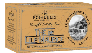
Domaine des Aubineaux Caramel