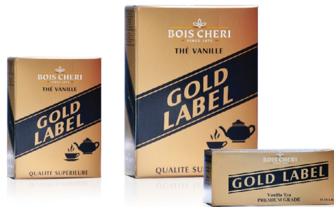
Gold Label – Vanilla