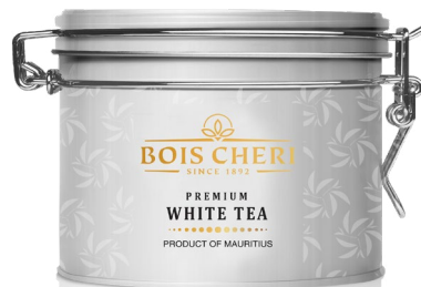
White Tea Loose Tea - 125g