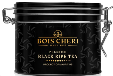
Black Ripe Tea Loose Tea - 150g