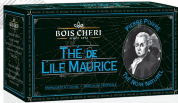
Pierre Poivre English Breakfast

Each box features a distinctive and iconic name, reflecting the unique character of our blends.