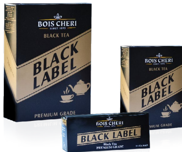
Black Label – Black Tea